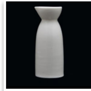
Sake Bottle DV.ALU.739 5.25"(3.4cm) 6.5oz