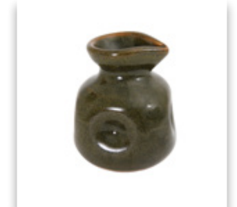
Stoneware Soy Pot - Green STN.1600.05 5.5oz(.16L)