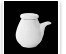
Soy Pot w/ Lid DV.5700.18 3.125"(8.0cm)H 5.25oz(.16L)