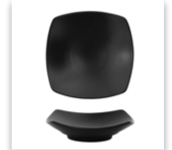
Black Underliner - Porcelain DV.5700.BLK.09 3.75"(9.5cm)