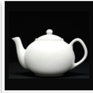
Teapot TC7600.DV.36 16oz(.47L) TC7600.DV36.5 Lid only