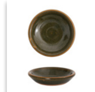
Stoneware Dipping Dish - Green STN.1600.03 3.75"(9.5cm)