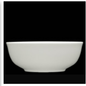
Serena Bowl TC7600.DV.57 7.75"(19.75cm) 44oz