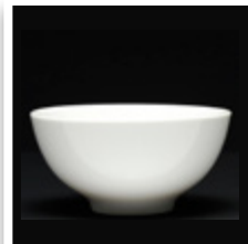
Rice Bowl TC7600.DV.43 4.5"(11.5cm) 9.5oz