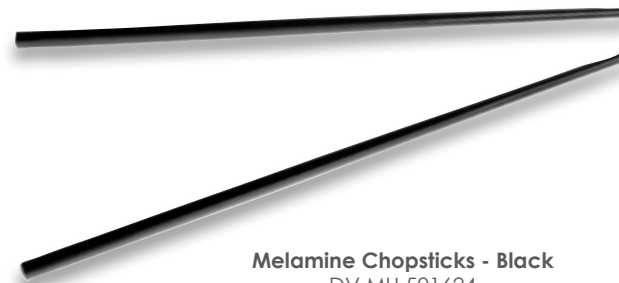
Melamine Chopsticks - Black DV.MU.501624 9.5"(24cm), set of 2