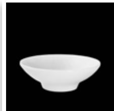
Footed Dipping Dish DV.5700.08 3.25"(8.2cm), 1.5oz(.04L)