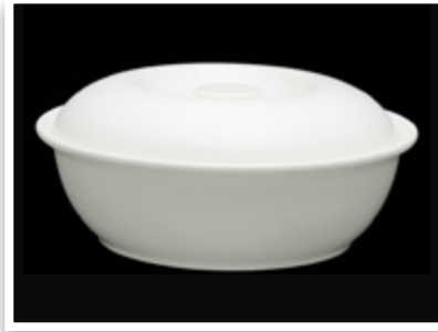
Casserole w/Lid TC7600.DV.58 10"(25.5cm) 76oz