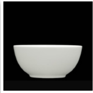
Serena Bowl TC7600.DV.56 7"(17.5cm) 32oz