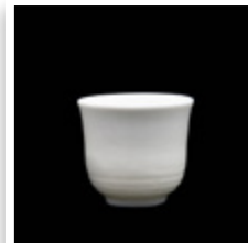
Sake Cup DV.ALU.740 2.2"(5.5cm) 3.0oz