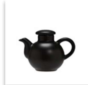
Stoneware Soy Pot w/lid DV.STN.2003 3.5"(9.0cm)H 6oz