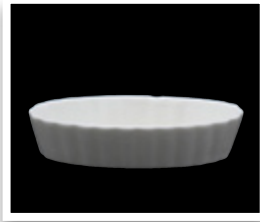
Oval Creme Brulee/Tart Dish 5100.F0000.17