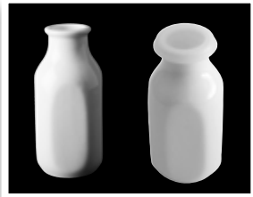
Milk jug 5100.F0000.35 Lid sold separately 5100.F0000.35L