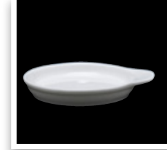
Tasting Plate 5100.F0000.25