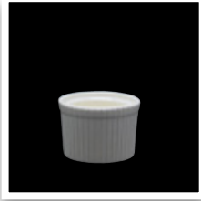
Condiment Dish 5100.F0000.19