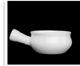
Round Cassolette 5100.F0000.43