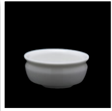
Butter Crock 5100.F0000.29