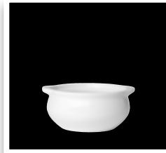
Small French Onion Crock 5100.F0000.42