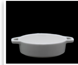
Round Cassolette 5100.F0000.10