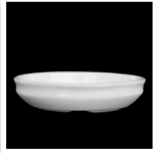
Oval Butter/Spread Crock 5100.F0000.38