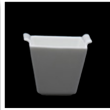
Square Tall Dish 5100.F0000.27