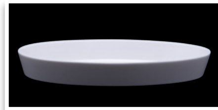
Oval Baker 5100.F0000.15