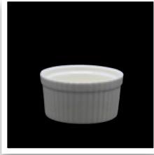
Souffle/Serving Dish 5100.F0000.20