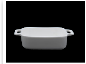
Square Cassolette 5100.F0000.14