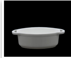
Oval Cassolette 5100.F0000.05