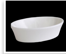
Oval Baking Dish 5100.F0000.45