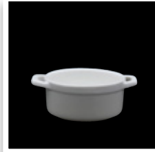
Round Cassolette 5100.F0000.03