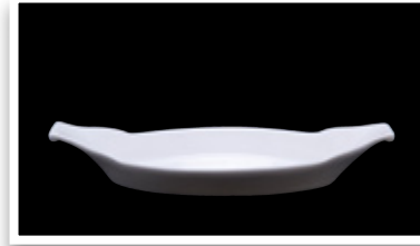
Oval Serve Dish 5100.F0000.11