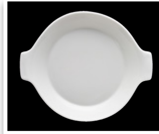
Round Serve Dish w/ handles 5100.F0000.02