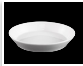
Round Serve Dish 5100.F0000.33