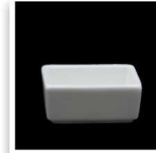
Square Stackable Sauce Dish 5100.F0000.26