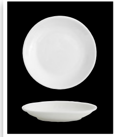
Tasting Plate 5100.F0000.44