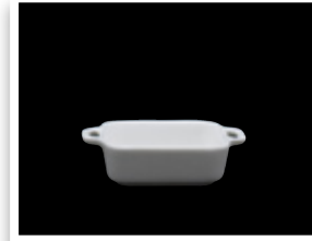
Square Cassolette 5100.F0000.13