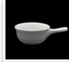
Sauce Pot 5100.F0000.24