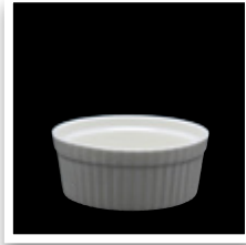
Souffle/Serving Dish 5100.F0000.21