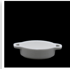
Round Cassolette 5100.F0000.09