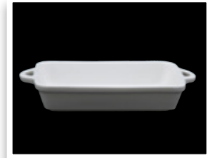
Rectangle Cassolette 5100.F0000.08