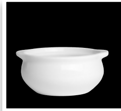
French Onion Crock 5100.F0000.40