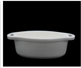
Oval Cassolette 5100.F0000.06