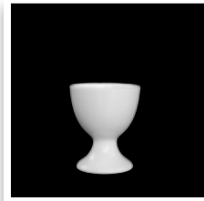
Egg Cup 5100.F0000.34