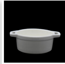
Round Cassolette 5100.F0000.04