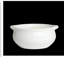
Large French Onion Crock 5100.F0000.41