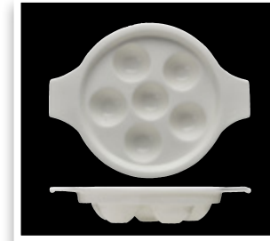
Escargot Dish 5100.F0000.31