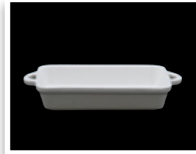
Rectangle Cassolette 5100.F0000.07