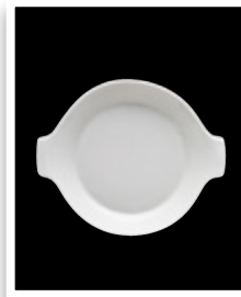
Tasting Plate 5100.F0000.01