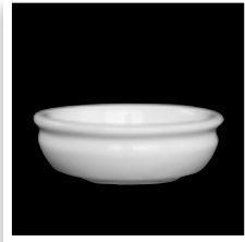
Round Butter/Spread Crock 5100.F0000.37