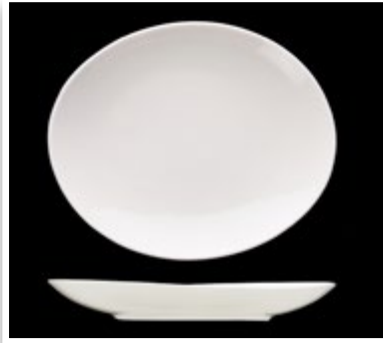
Oval Coupe Plate HK.5710.F000.15 10.75"(27.5cm) HK.5710.F000.02 8.2"(20.7cm)