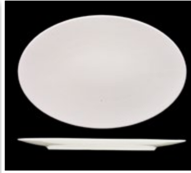
Oval Platters HK.5710.F000.25 15.25"(39cm) HK.5710.F000.24 11.0"(28cm) HK.5710.F000.22 9.5"(24cm)