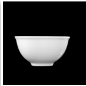
Rice Bowl HK.5710.F000.11 8oz