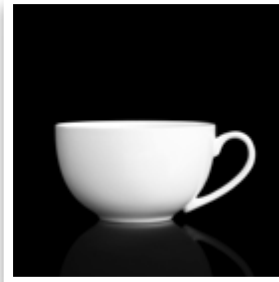
Tea/Coffee Cup HK.5710.F000.10 9oz