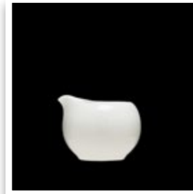
Creamer HK.5710.F000.35 3.5oz