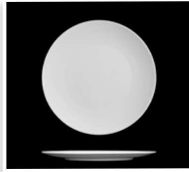
Round Plate HK.5710.F000.21 8.25"(21cm)